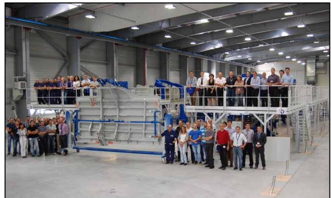
Delivery of the first main landing gear door of the A350-1000